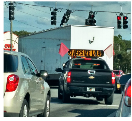
Can you say "oversize load"!?! The over height package in this picture is actually touching the traffic lights. Speaking of over height vehicles, please search for "11Foot8 Bridge Crashes" on YouTube if you have not seen these videos reinforcing the need for proper shipment planning for any oversize loads.