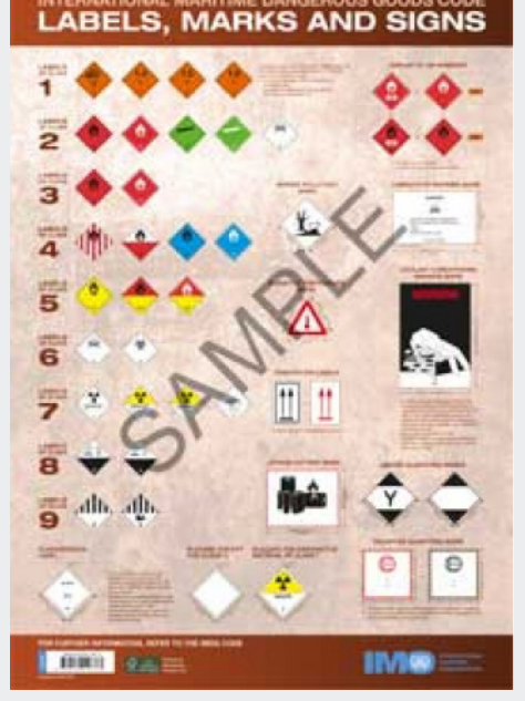
IG223E - Wall chart: IMDG Code Labels, Marks & Signs, 2016, copied from IMO Publishing Product Details website on September 27, 2016

The International Maritime Organization (IMO) has updated their full-color wall chart, which illustrates the labels, marks and signs required under The International Convention for the Safety of Life at Sea (SOLAS) and detailed in the International Maritime Dangerous Goods (IMDG) Code. This edition includes a new Class 9 label for lithium batteries and associated lithium battery mark.